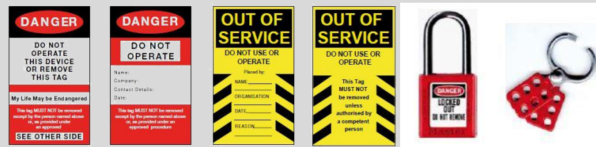
Typical tags, personal red lock, and multi-lock device